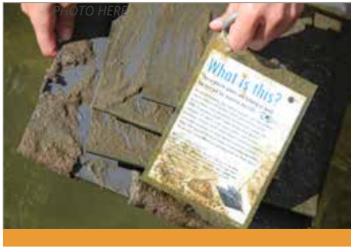
A volunteer pulls up monitoring plates to check for AIS.

A new district program launched in 2015 enlisted community members to help monitor for invasive mussels. Fourteen lake shore residents volunteered for the Adopt a Dock program in its first season. Volunteers hung monitoring plates off of their docks, and checked them monthly for possible mussel growth. The district is happy to report that no mussels were detected. This fits with monitoring efforts by staff at public boat ramps and in water samples, which also did not detect mussels. Interested in volunteering in 2016? Contact the district: mjordan@rpbcd.org ; 952-607-6481