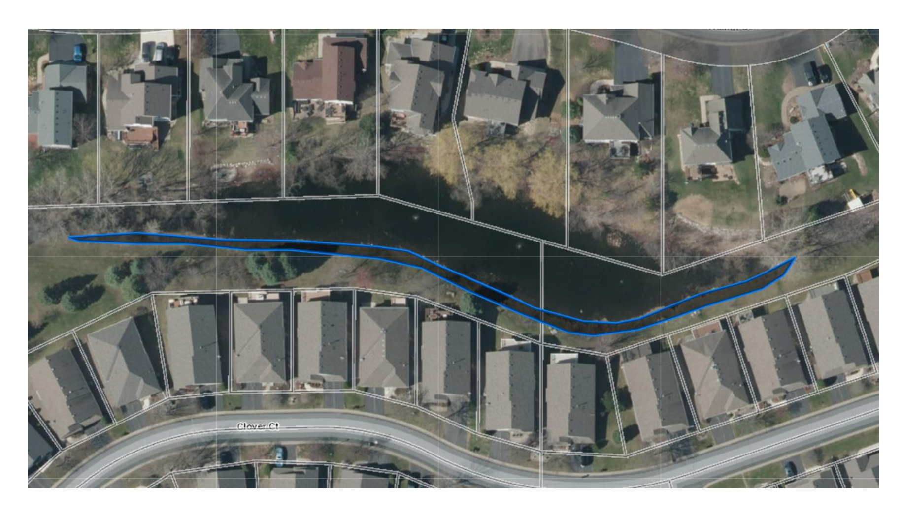
Blue highlighted buffer area – 600' x 7' = 4,200 SF